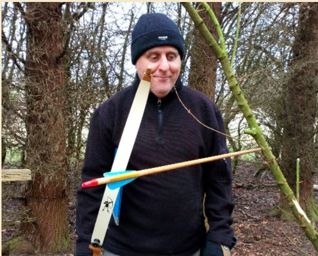
Tree = 1 Rob = 0 ...