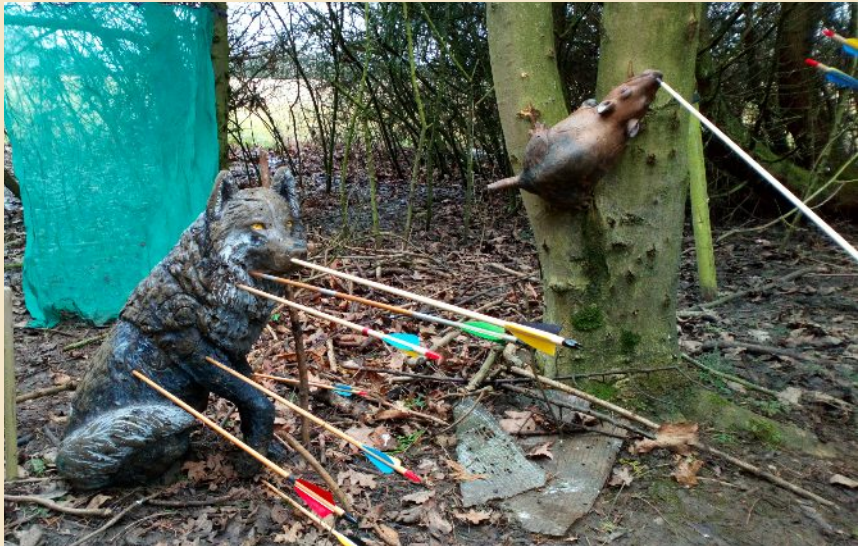
Jay with a very impressive predator and prey shot there!