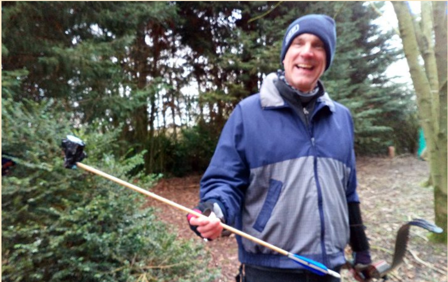
Damage to club property Kev - that's a £10 fine. Luckily the bear target didn't feel a thing...